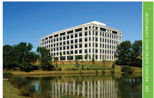
MONUMENT CORPORATE CENTER - MD

American Speech-Language-Hearing Association AIMCO Arnold & Porter The Bozzuto Group Credit Lyonnais Federal Realty Investment Trust George Washington University Hines Interests Holland & Knight ING/Clarion Partners INOVA Health System The JBG Companies JPI LCOR Lowe Enterprises McGuire, Woods McKenna Long & Aldridge North Carolina Turnpike Authority Northwestern Mutual Life Penrose Group Patton, Boggs Pillsbury The Related Companies Trammell Crow Residential UDR U.S. Department of Labor U.S. General Services Administration University of Maryland Vornado Realty Trust Wood Partners Woodlands Development Company