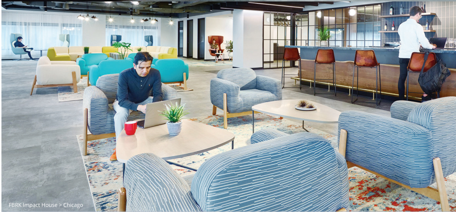
FBRK Impact House > Chicago