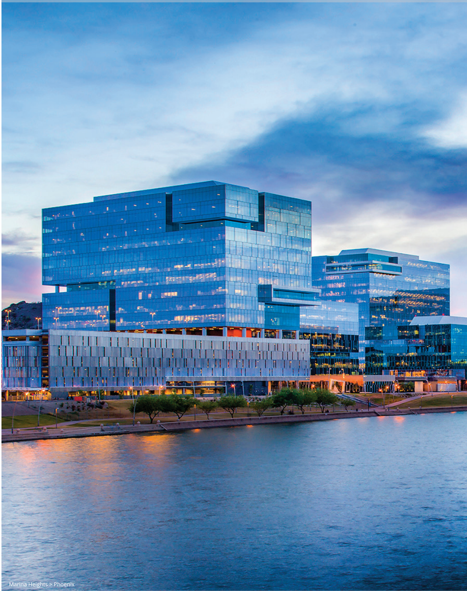
Marina Heights > Phoenix